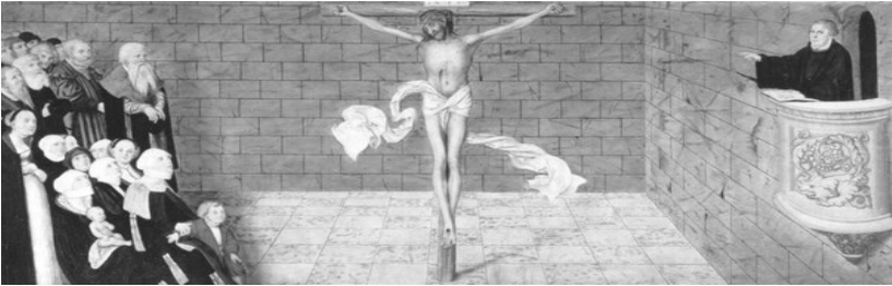
Luther Pointing to Christ While Preaching Lucas Cranach the Elder

Luther first and foremost pointed to Jesus Christ as God’s self-revelation of love, freedom and salvation. His entire life was devoted to proclaiming the centrality of Jesus’ death and resurrection as the sole hope for a sinful and death-bound humanity. Everything the church said or did, from pope to priest to the common Christian, was to be measured against whether or not the Good News of Jesus could be clearly heard and understood. Calling followers of Jesus “Lutherans” was more than a distraction for Luther, it was an abomination.